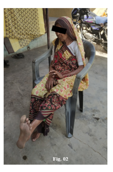
Fig 2. High sitting knee extension Exercise