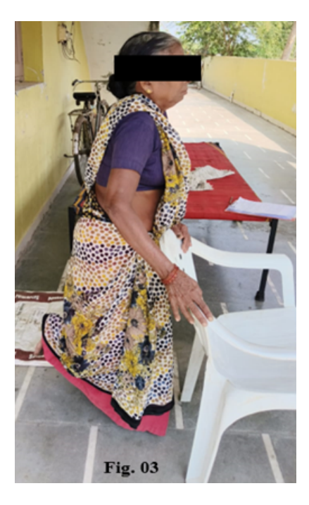
Fig 3. Standing knee curls (Hamstring)