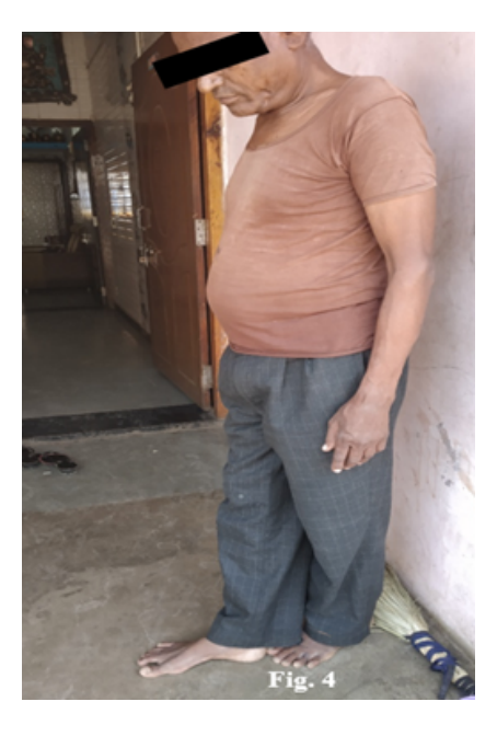
Fig 4. Tandem standing/Toe Heel standing

The multicomponent exercise programme involved an upper and lower limb progressive resistance training program for 2 to 3 times per week, with 3 sets of 8 to 12 repetitions at an intensity that started with 20%-30% of 1RM and progressed to 80% of 1RM three times per week. Balance training (static, dynamic, and proactive training) was given three times per week. In the endurance training, participants were asked to walk for 15 to 30 minutes three times per week with moderate intensity (11 to 13 points on the Borg scale). The participants were asked to maintain a compliance log or daily log of activities performed. All the exercises were given on an individual basis at the participants doorsteps, as there was no provision for a common place in the villages where exercises could have been given in groups to save time as well as increase motivation among the participants.