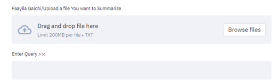
Fig 2. Screenshot Interface