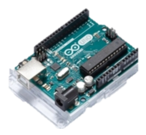
Fig 2. Arduino Uno R3

Arduino Uno is an ATmega328 based microcontroller board. It is an open-source prototyping tool, and its simplicity makes it suitable for hobbyists and professionals alike. The Arduino Uno has 14 optical input/output pins (6 of which can be used as PWM outputs), 6 analog inputs, a 16 MHz crystal oscillator, a USB connection, a power jack, an ICSP header, and a reset button. It contains everything you need to help a microcontroller; link it to a device with a USB cable or power it with an AC-to-DC adapter or battery to get started. Figure 2 displays Arduino UNO R3 and the details as seen in Table 2.