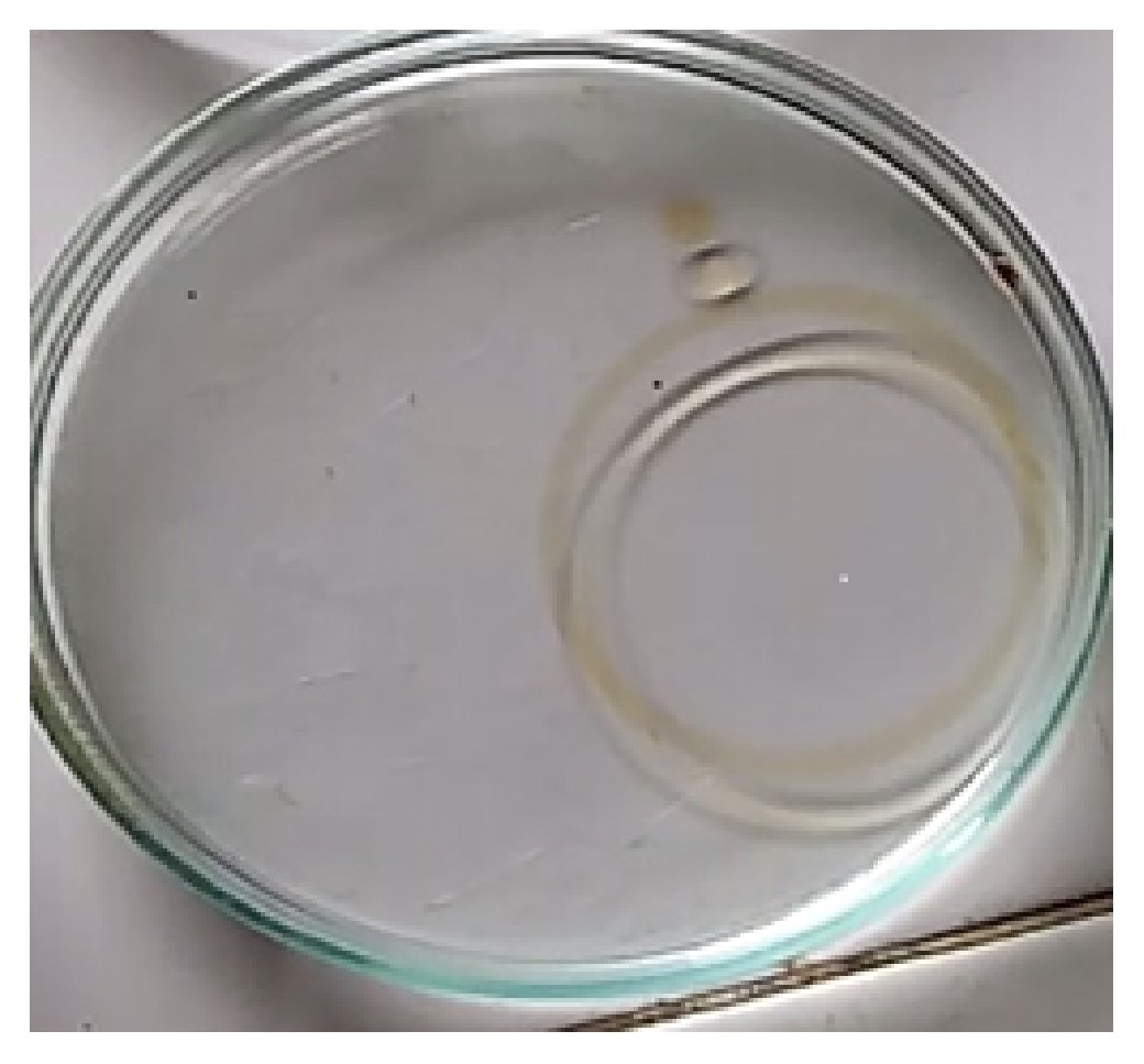
Fig 2. Oil displacement shown due to the production of biosurfactant by yeast isolate Ky-46. The clear zone formation on crude oil by biosurfactantproduced by isolate Ky-46

Fig 1. Parafilm M Test for biosurfactant production by selected yeast isolates. Parafilm M tests of isolates Ky-46, Ky-59, Ky-86 andControl (Cell free sterile fermentative media)