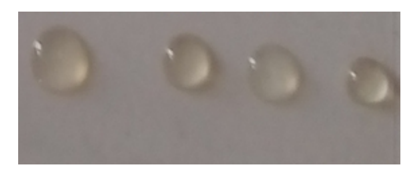
Fig 1. Parafilm M Test for biosurfactant production by selected yeast isolates. Parafilm M tests of isolates Ky-46, Ky-59, Ky-86 andControl (Cell free sterile fermentative media)