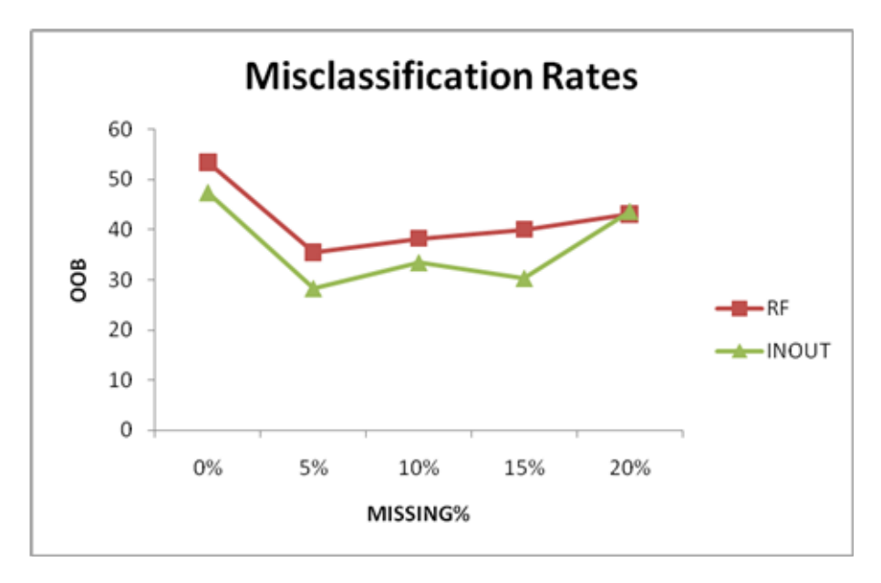
Figure 1. Line graph for misclassification rate.