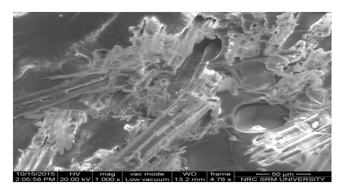
Figure 6 (b). SEM micrograph of pineapple/sisal/epoxy hybrid composite.