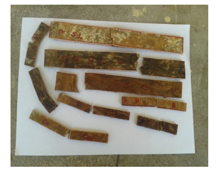
Figure 5. Tested specimens.

The five different hybrid composites of samples are tested their tensile, impact and flexural strength from respective machines. Impact test carried out in izod impact testing machine and both tensile and flexural testing were carried out in Universal Testing Machine (UTM). Figure 5 shows tested specimens of five different hybrid composites.