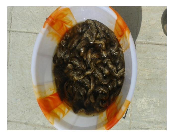
Figure 2. Fibers immersed in solution.