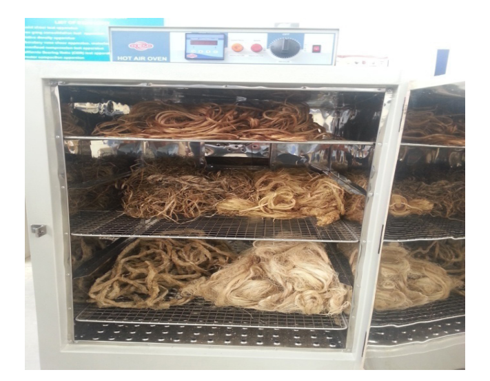
Figure 3. Fibers placed in hot air oven.