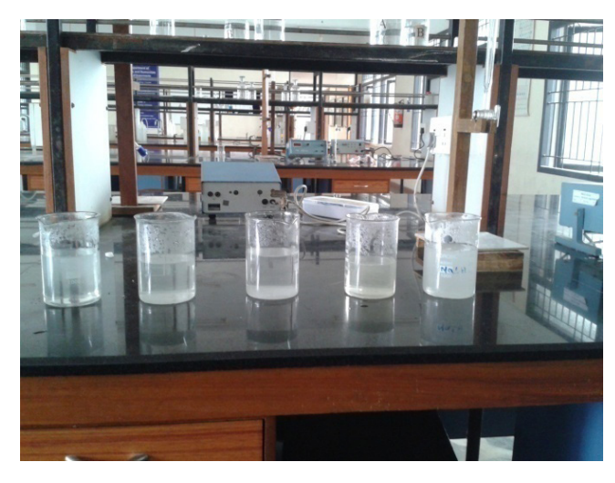
Figure 1. Chemical preparation.

For that, alkaline treatment using sodium hydroxide (NaOH) is the most commonly used chemical treatment for bleaching and cleaning the surface of bio fibers to produce high-quality fibers. 5% sodium hydroxide solution was prepared using NaOH pellets and distilled water. Pineapple, sisal, flax and kenaf fibers were then dipped in the solution for 3 hours separately. Solution preparation and fibers immersed in solution are shown in Figures 1-2 respectively. Then it was washed with flow water. Then it was kept in hot air oven for 4 hours at 60°C<sup>8</sup>. Fibers kept in hot air oven are shown in Figure 3.