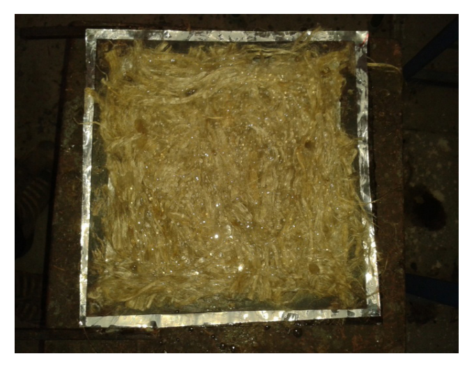
Figure 4. Fibers stacking.

Fiber orientation and volume fraction are the two important factors that influence the properties of the composite. In this research, all the bio fibers are used in the form of long fibers and epoxy resin used in the form of continuous phase to the weight fraction of 40% and 60% respectively to prepare the composites. The epoxy resin LY556 and the corresponding hardener (HY951) were mixed in a ratio of 10:1 by weight as recommended. The mixing was done thoroughly before the mixture filled into the mould and pressed in a hydraulic press at the temperature of 130°C for 45 minutes and a pressure of 35 kg/cm<sup>2</sup> for 45 minutes is applied before it is removed from the mould. Then, this sample is post cured at standard atmosphere for some period of time to study the effect of post curing time on mechanical properties<sup>2</sup>. Fibers stacking arrangement is shown in Figure 4.