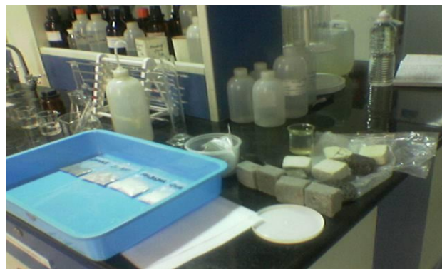
Figure 2. Various materials used in the project study along with blocks made.

Composite containing ceramic and COPR samples are crushed and passed through a 9.5 mm screen. Then leaching solution (5.7 ml glacial acetic acid diluted to 1 lit with double distilled water) is added to the composite sample in a Zero Head space Extractor (ZHE) at a Liquid: Solid