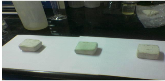
Figure 4. COPR sample: Ceramic material combinations vitrified at 1000° C.

ratio of 20:1. Leaching solution (500 ml) with composite material (25 gr) has been used. The sample is agitated in rotary shaker at 30 rpm for 18 hours. The leached solution is filtered and analyzed for quantity of chromium present by Atomic Absorption Spectrophotometer.