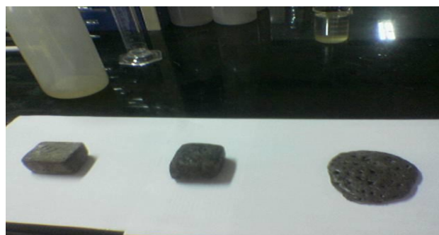
Figure 3. COPR sample: Ceramic material combinations vitrified at 1200° C.