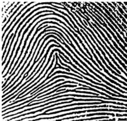
Figure 1. Arches.