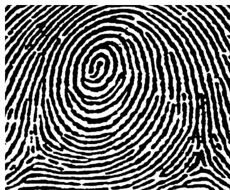
Figure 3. Whorls.