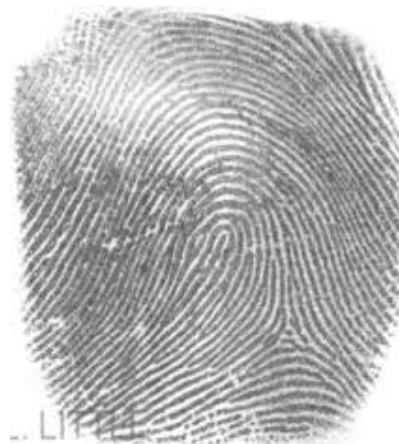
Figure 2. Loops.