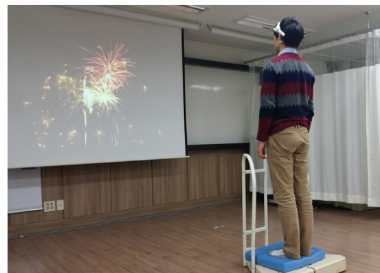
Figure 1. Participant is performing the task under external focus of attention.

Participants stood barefoot on the GBS with unstable surface over a 6 cm-thick balance pad (Airex, Sins, Switzerland) and measurements were taken under three conditions: control, internal and external foci of attention, while standing as immobile as possible. When postural sway was measured, participants were instructed to look straight ahead and hang their arms naturally 9,11,16,21 . They were asked to look at a dot 2 m ahead and stand quietly (control condition), to focus on their foot to minimize postural sway while looking the dot (internal focus of attention condition), and to focus on the screen ahead by EEG biofeedback (external focus of attention condition) showed in Figure 1. EEG-biofeedback was designed as follows; 1. EEG signal was detected by EEG single dry