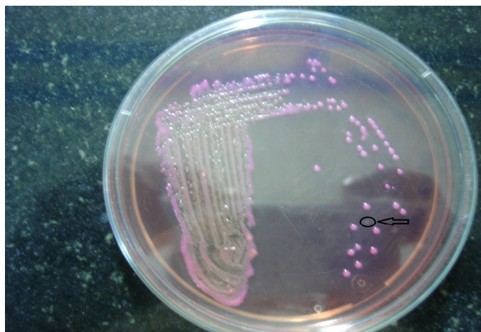
Fig.1. Non sorbitol fermenting bacterial colony in MSA agar plate

The objective of our study is to develop a cost effective nanofilter for drinking water purification after testing the contaminated water. The expected outcome of this study is the development of the cost effective nanofilter that would be able to filter out bacteria, organic and inorganic impurities and undesirable dissolved metal